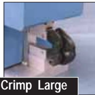
Crimp Large Gauge Wire